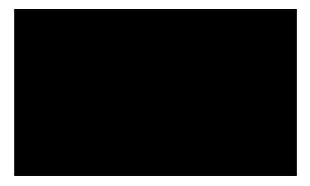
Figure (1): Corpuscle's member ship to two fuzzy sets of mass and energy