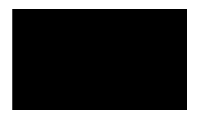
Figure (4): Electromagnetic waves belonging to the fuzzy set \{Y_2\}

In a similar way, we may define the photon in general as an energized particle of a low degree of membership to the fuzzy set of mass particles \mu_M (since m_{ph} = h \upsilon / c^2 ), and a high degree of a conjugate membership to any of the fuzzy sets of energy or electromagnetic waves of the categories {X}, {Y<sub>1</sub>} or {Y<sub>2</sub>} that can be denoted as \mu_{pX} , \mu_{pY1} or \mu_{pY2} . So, photons may behave as an energized particle of neutral, positive or negative charges according to the category of its conjugate electromagnetic waves. So, the postulated memberships offer logical reasoning or more plausible explanations for the behavior of some photons as charged particles [7] and also to the found polarization of photons [8]. Such attained understanding that removes the ambiguities of such phenomena improves the trueness of the stated postulates.